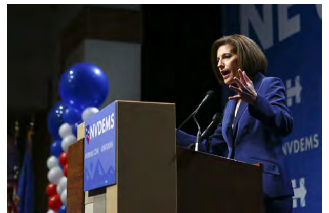
Sen.-elect Catherine Cortez Masto (D., Nev.) spoke to supporters after an election-watch party in Las Vegas early in the morning of Nov. 9.

The state was a rare electoral bright spot for the party, helped by culinary union's organizing efforts